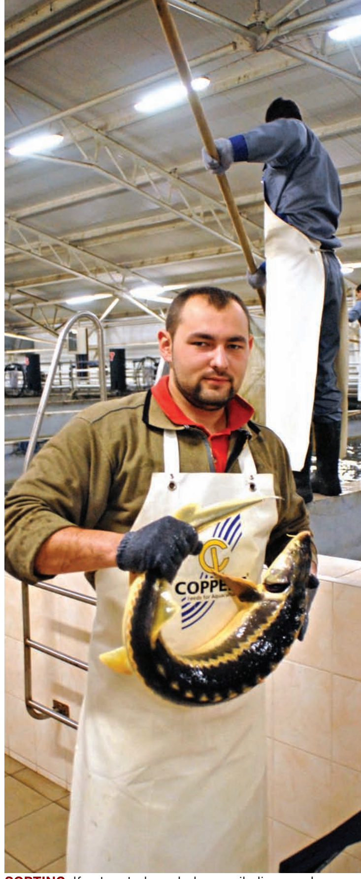
SORTING: If not sorted regularly, cannibalism can become a problem with sturgeon

According to Kaseva, there are three critical stages with farmed sturgeons. The first is when the