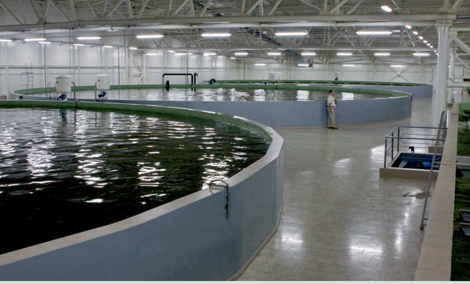
Large sturgeon are grown in 25 m round basins.

Aquatir Ltd farms sturgeon on the Dniester