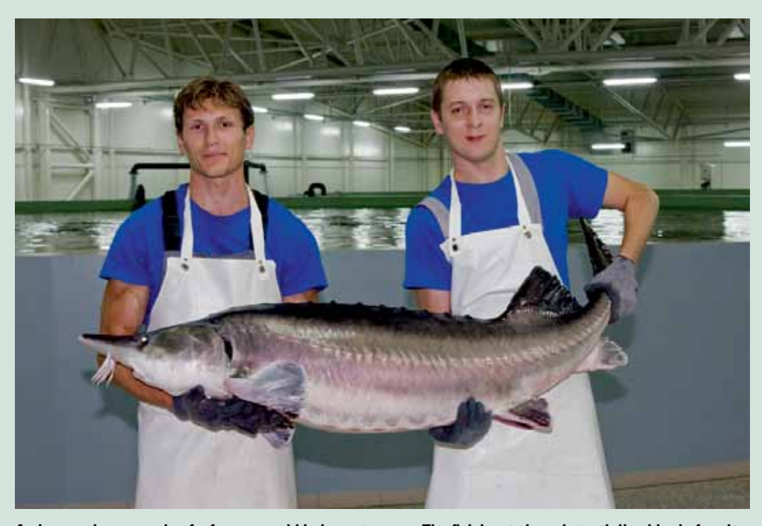
An impressive example of a four-year-old beluga sturgeon. The fish has to be substantially older before it produces caviar.

Based on experience gained by different specialists a completely new kind of spawning fish facility was developed. It enables the production and fresh delivery of very high-quality caviar at any time. This kind of facility would sooner be expected in countries like Russia, Iran or Kazakhstan, i.e. in countries that have been traditionally involved with sturgeon farming and caviar production. It is all the more satisfying that this success story was realised in Moldova thanks to the good cooperation between the partners. Already in